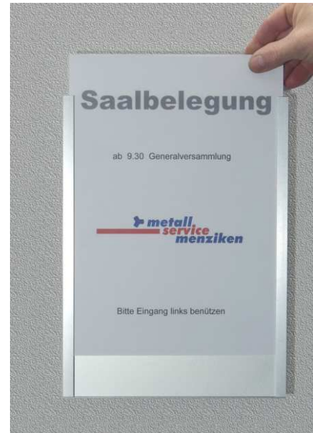
Easy to change inserts