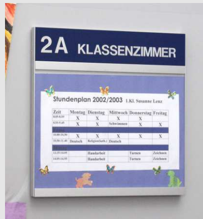
DIN A5 time table