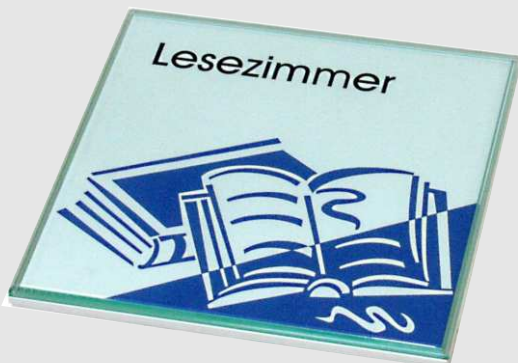
147 x 147 mm