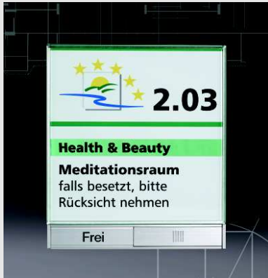
147 x 147 mm with "vacant/occupied" sliding insert