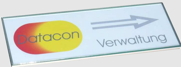
DIN A4 1/2 / 297 x 105 mm