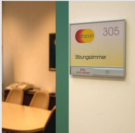
Door Sign DIN A6 with "do not disturb" announcement