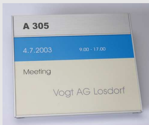
Door Sign DIN A5 with Header 42 mm