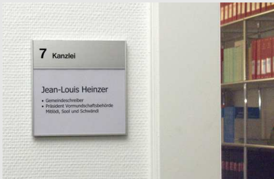
Door Sign DIN A6 with Header 42 mm