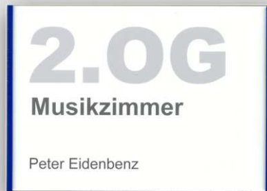
DIN A6 landscape