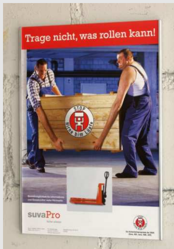
DIN A4 portrait