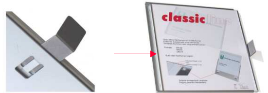
Vandal protection is not visible to the user.