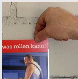
Problem free replacement of inserts